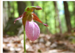
Pink Lady's Slipper in bloom